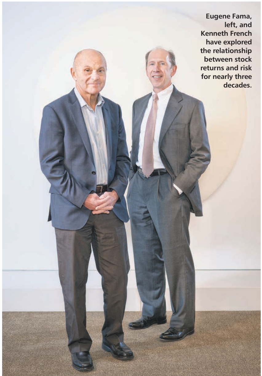
Eugene Fama, left, and Kenneth French have explored the relationship between stock returns and risk for nearly three decades.

The basics of market efficiency are often misunderstood. Some say that if factors such as a stock's value, size, trading momentum, and profitability—all of which are part of your multifactor model—indicate outperformance, then the market isn't really efficient.