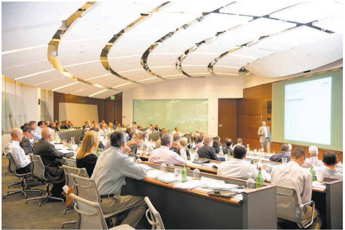
More than 100 advisors came to Dimensional's Austin, Texas, headquarters for two days of seminars.

Advisors selling DFA funds have monthly or quarterly meetings with one another, facilitated by a DFA manager, to discuss portfolio and practice manage-